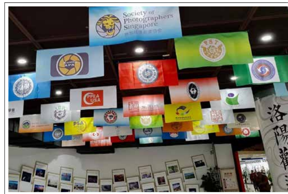
SPS was invited to participate in the 26th Congress of Federation of Asian Photographic Art (FAPA)

在2017年、2018年及2019年，SPS连续3年在滨海湾金沙举办摄影展，呈献会员摄影佳作