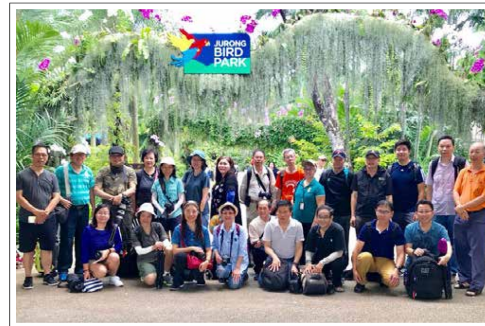
SPS organized many Members' Outings from time to time