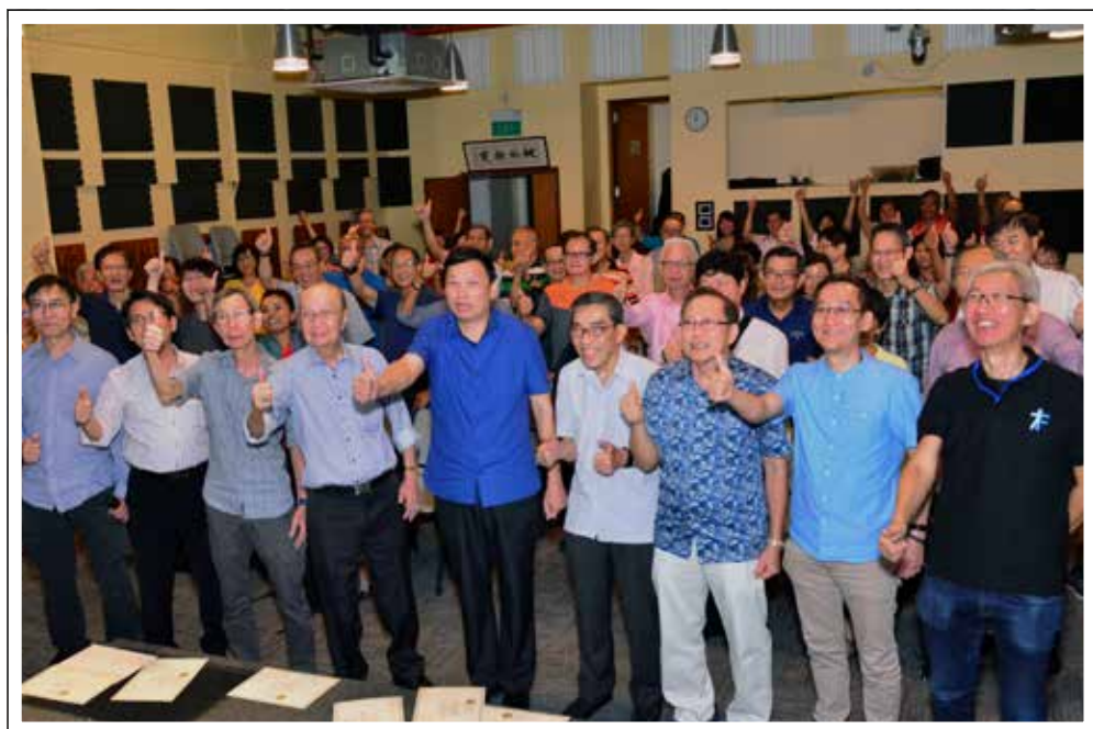
SPS Members' annual CNY get together