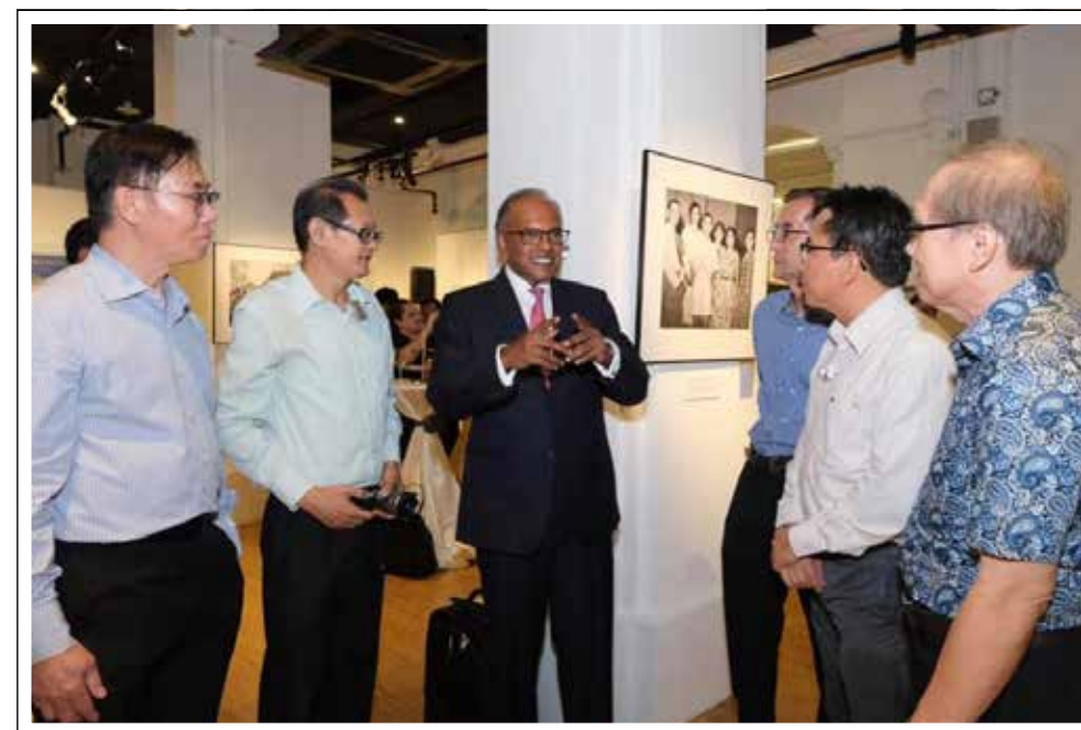
SPS Council members were invited to attend Marjorie Doggett - Book Launch & Exhibition, both were launched by the Minister for Home Affairs, and Minister for Law, Mr. K Shanmugam

SPS理事受邀出席摄影集《玛乔丽·多格特的新加坡》的新书发布及摄影展，由内政部长兼律政部长尚穆根先生主持开幕