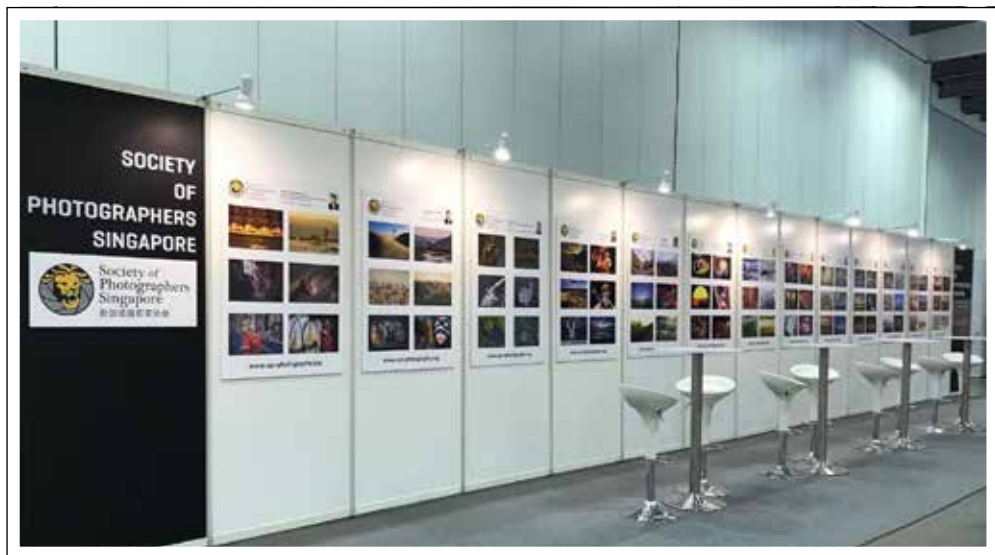
SPS held Photo-exhibitions at Marina Bay Sands for three consecutive years 2017, 2018 and 2019 to showcase photographs taken by its members

在2017年、2018年及2019年，SPS连续3年在滨海湾金沙举办摄影展，呈献会员摄影佳作