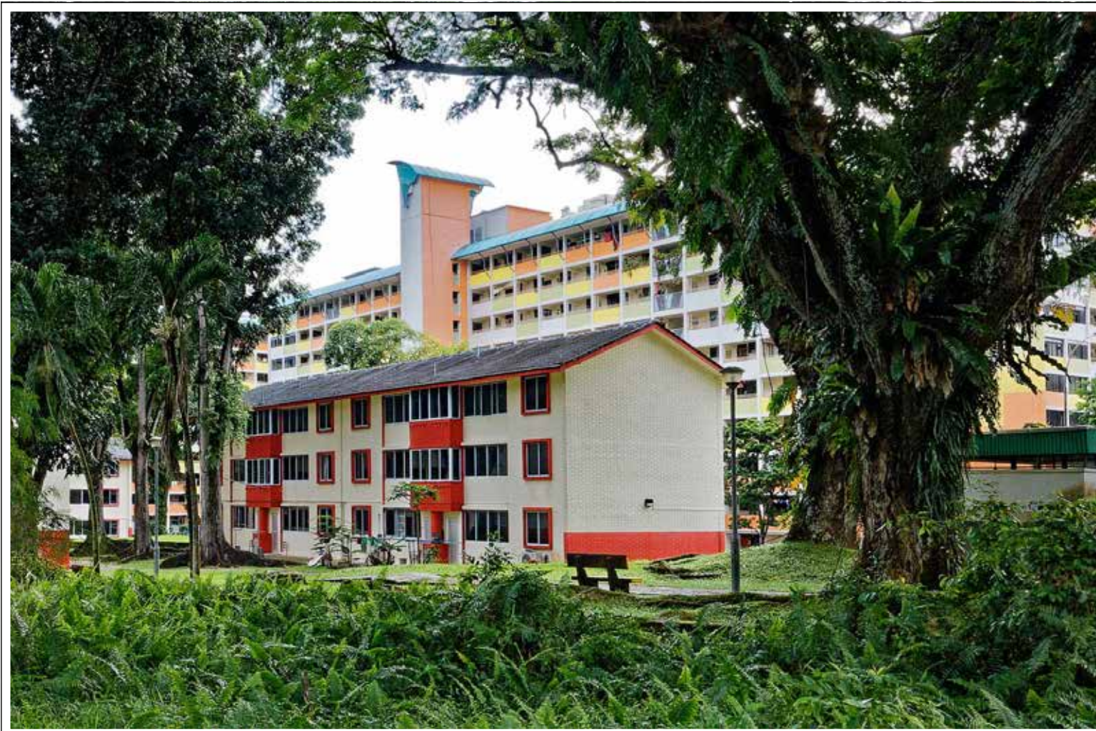
Looking at the old HDB housing blocks through the old bushes

老树丛中看改良信托局 (HDB的前身) 建造的老组屋和树立于其后10楼组屋, 俗称“十楼”